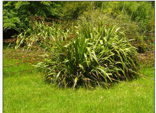
Caption: Phormium cookianum subsp. hookeri

http://nzpcn.org.nz/flora_details.asp?ID=1111