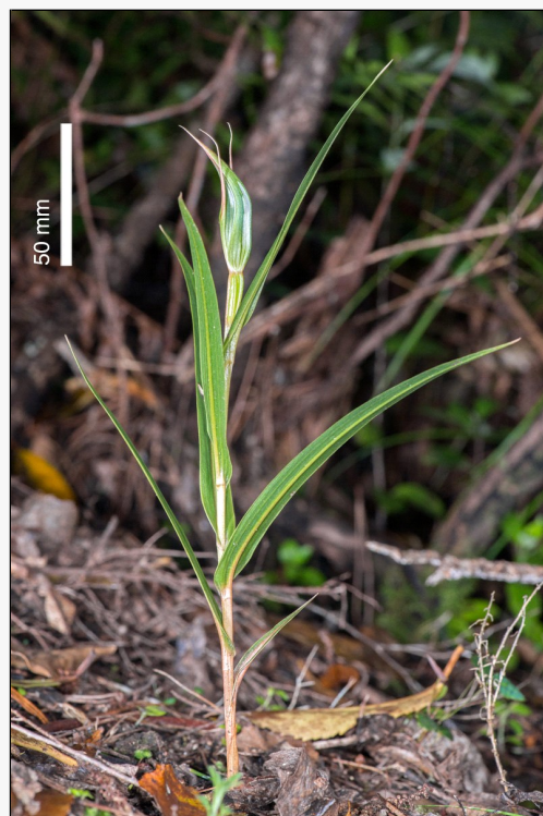
Caption: Stokes Valley, Lower Hutt. Photographer: Jeremy Rolfe

http://nzpcn.org.nz/flora_details.asp?ID=1211