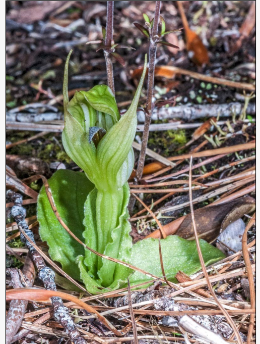
Caption: Tararua Range. Nov 2012.

http://nzpcn.org.nz/flora_details.asp?ID=1219