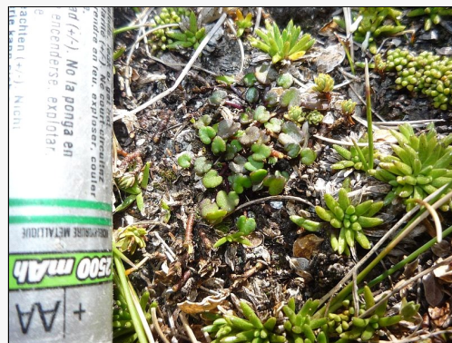
Caption: Harris Mountains, 1700m