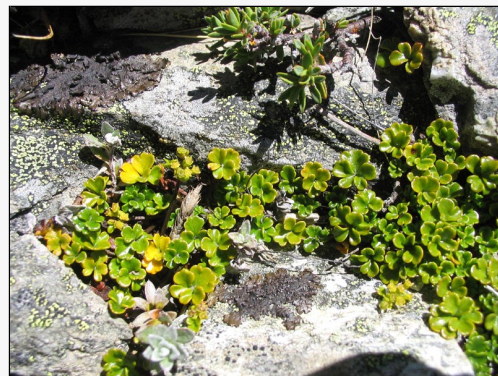
Caption: Schizeilema hydrocotyloides, Dunstan Range

http://nzpcn.org.nz/flora_details.asp?ID=1287