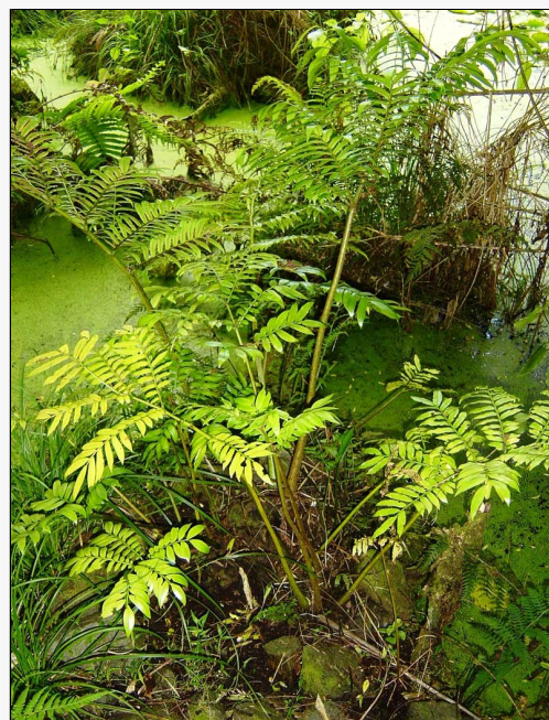
Caption: Ptisana salicina