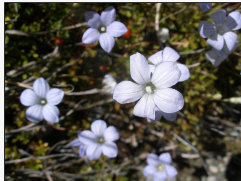
Caption: Routeburn Track, Fiordland

http://nzpcn.org.nz/flora_details.asp?ID=1361