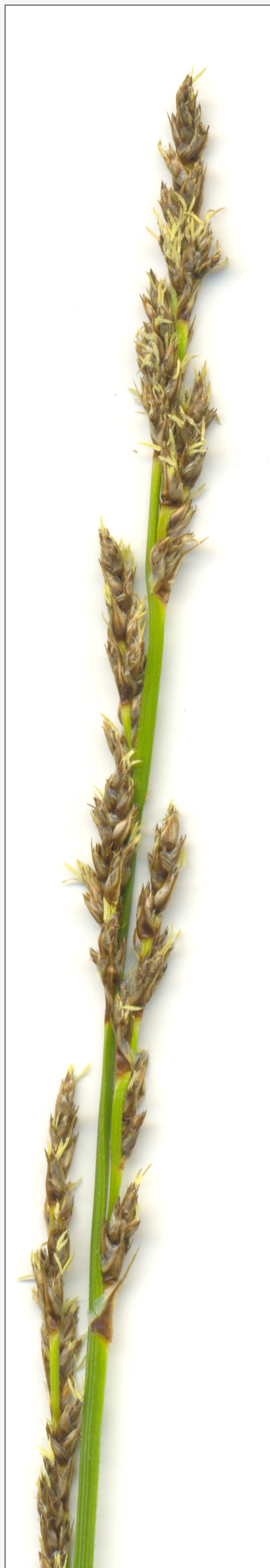
Caption: Flower of Carex virgata