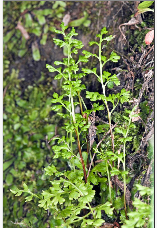
Caption: Mangatoetoe Stream, Palliser Bay.

http://nzpcn.org.nz/flora_details.asp?ID=147