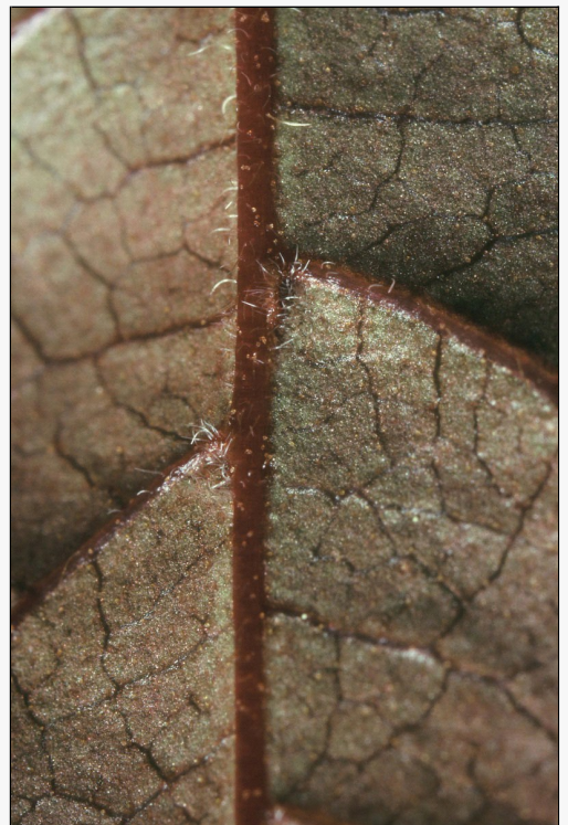
Caption: J.E. Braggins