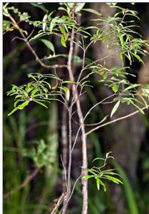
Caption: Te Arai Scenic Reserve, Northland. Mar 2007.