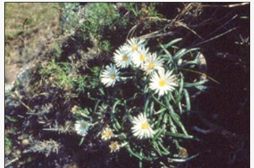
Caption: Whatipu (December)