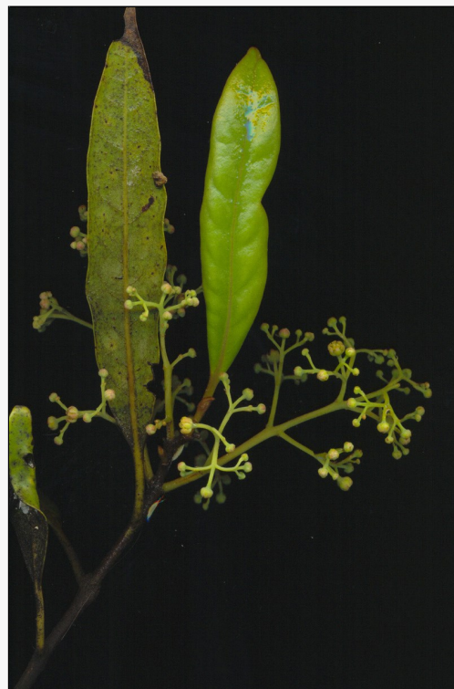
Caption: Flowers of Beilschmiedia tawa