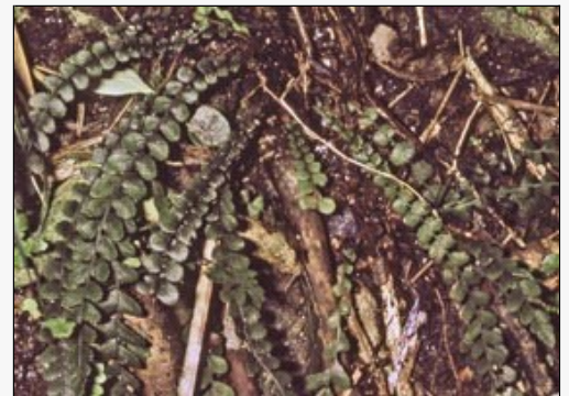
Caption: Waikanae. May 1984.