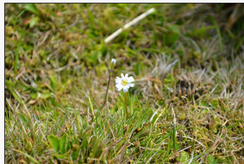
Caption: Enderby Island

http://nzpcn.org.nz/flora_details.asp?ID=1574