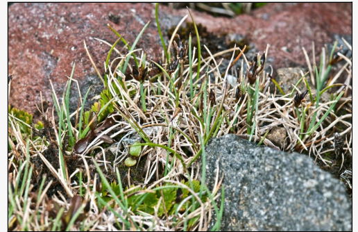
Caption: Mount Ruapehu. Feb 2012.

http://nzpcn.org.nz/flora_details.asp?ID=1588