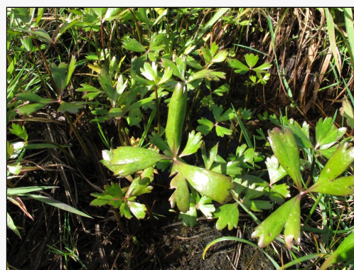
Caption: Waipori, Waihola Wetlands

http://nzpcn.org.nz/flora_details.asp?ID=198