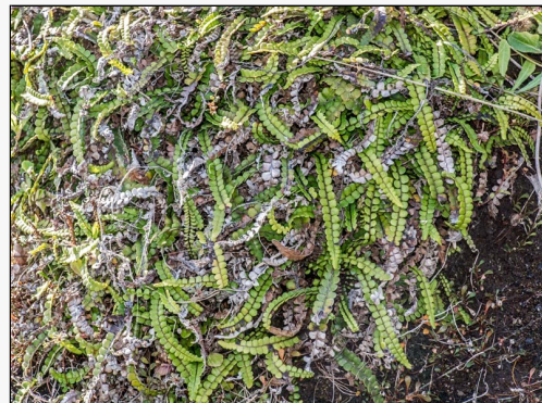
Caption: Kaupokonui, south Taranaki coast.

http://nzpcn.org.nz/flora_details.asp?ID=2069