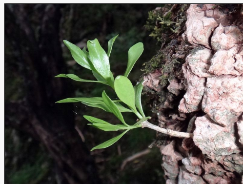
Caption: young plant on Plagianthus regius