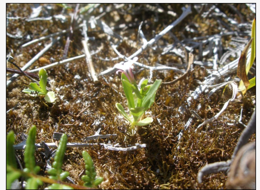
Caption: Chatham Island