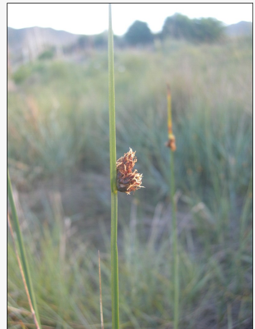
Caption: Te Wherowhero Lagoon