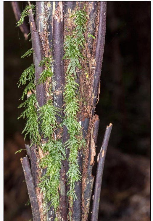
Caption: Stokes Valley, Lower Hutt. May 2013.

http://nzpcn.org.nz/flora_details.asp?ID=2276