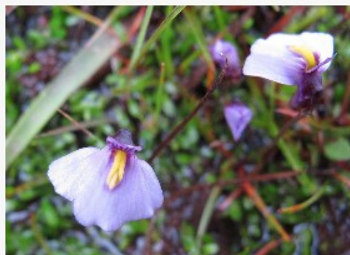
Caption: Lammerlaw Range

http://nzpcn.org.nz/flora_details.asp?ID=2283