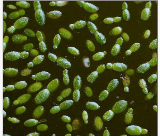
Caption: Wolffia australiana

http://nzpcn.org.nz/flora_details.asp?ID=2284