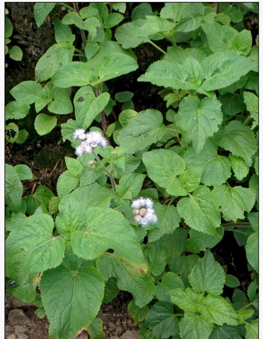
Caption: South Meyer Island, Kermadec Islands. May 2011.