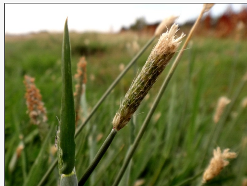
Caption: Waituna Lagoon, Southland