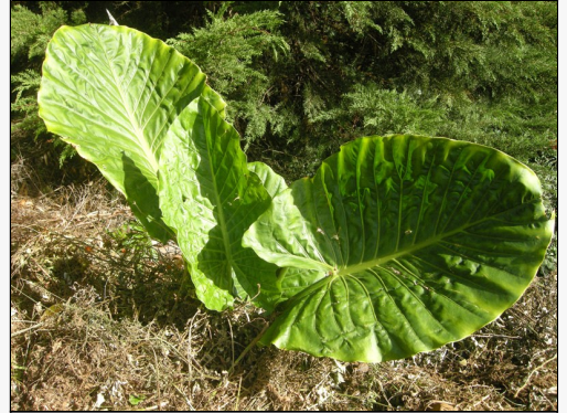
Caption: Robinson Crusoe Island, Chile

http://nzpcn.org.nz/flora_details.asp?ID=2493