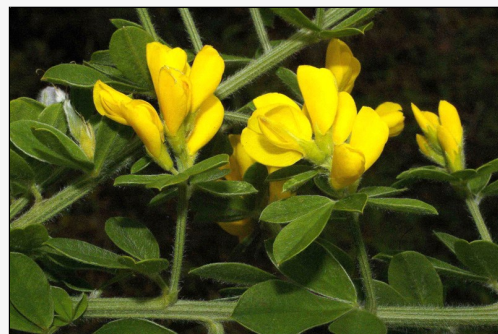
Caption: Teline monspessulana