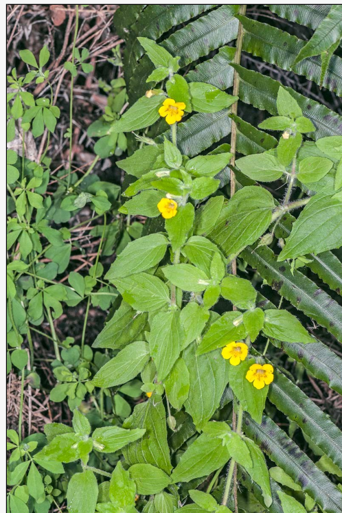
Caption: Riverstone Terraces, Upper Hutt. Jan 2013.

http://nzpcn.org.nz/flora_details.asp?ID=3198