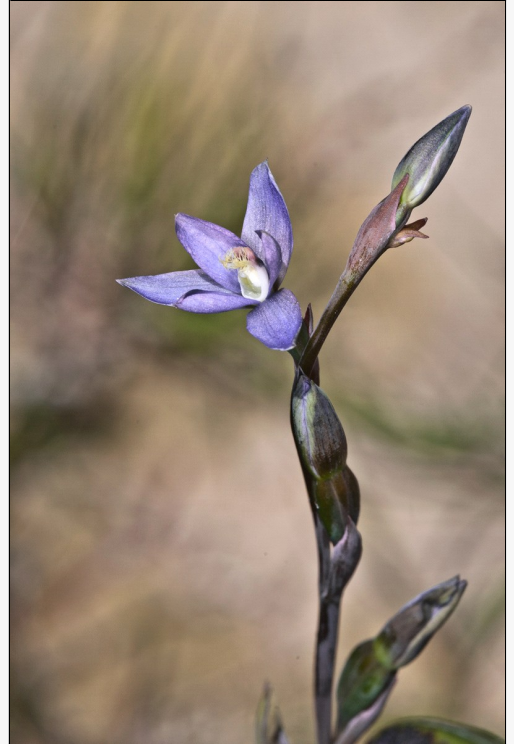
Caption: Stokes Valley, Lower Hutt. Dec 2011.

http://nzpcn.org.nz/flora_details.asp?ID=326