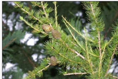
Caption: Larix decidua

http://nzpcn.org.nz/flora_details.asp?ID=3375