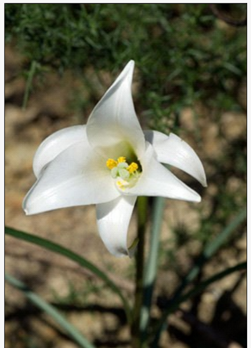
Caption: Gracefield, Lower Hutt. Aug 2006.