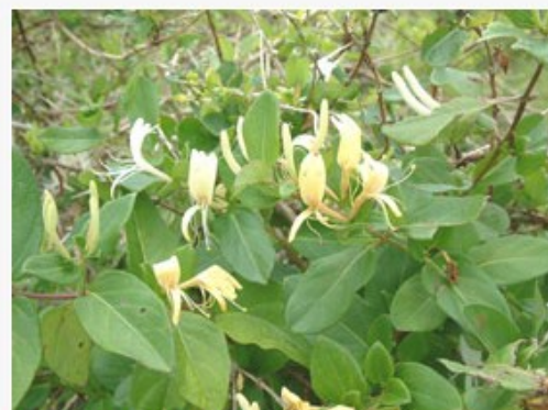
Caption: Lonicera japonica Photographer: John Smith-Dodsworth

http://nzpcn.org.nz/flora_details.asp?ID=3456