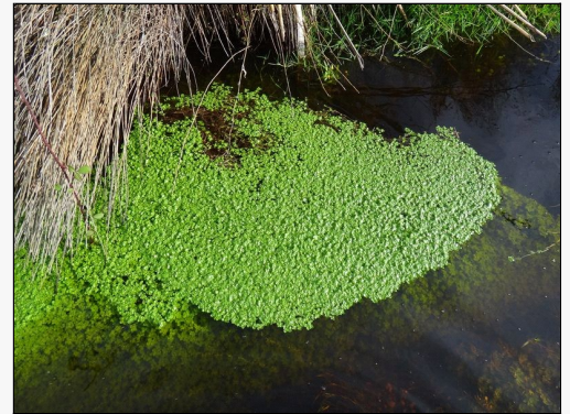
Caption: Waituna Lagoon, Southland

http://nzpcn.org.nz/flora_details.asp?ID=3573