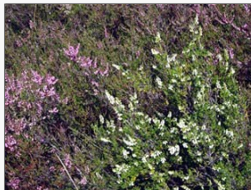
Caption: Tongariro National Park.