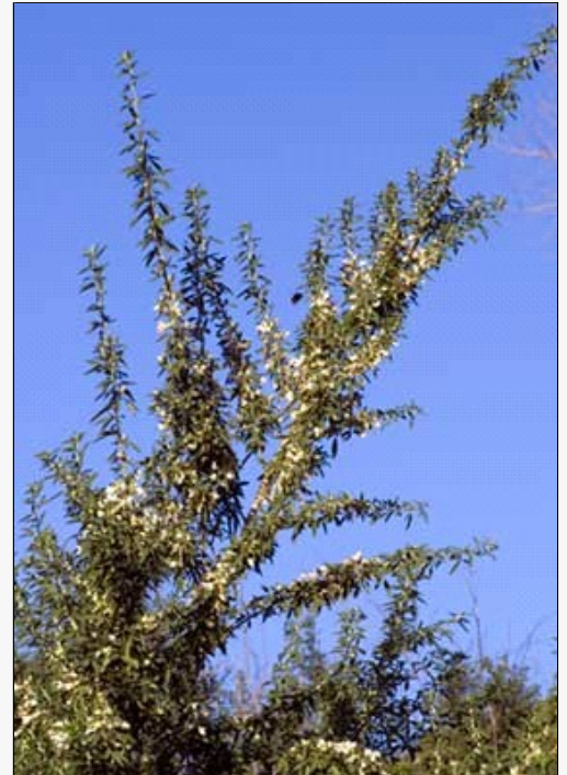
Caption: Hutt River Trail north of Stokes Valley. Jun 2006.