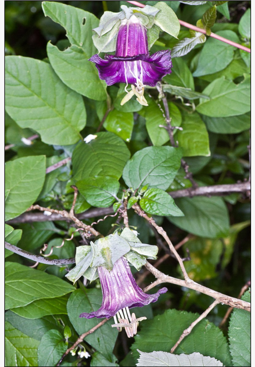
Caption: Lower Hutt, Hutt River Trail near Belmont. Mar 2011.

http://nzpcn.org.nz/flora_details.asp?ID=3722