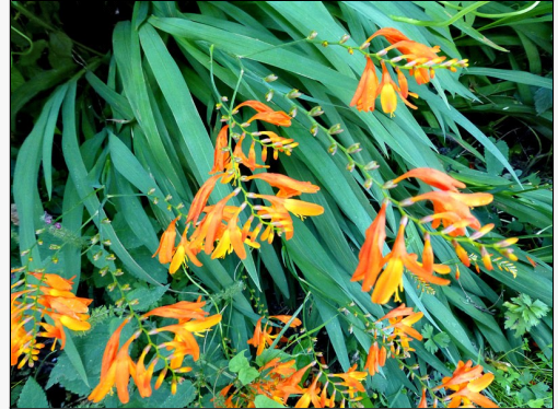
Caption: Whanganui. Jan 2013.

http://nzpcn.org.nz/flora_details.asp?ID=3789