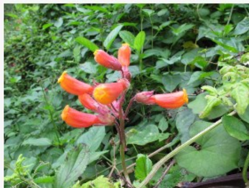
Caption: Taier River