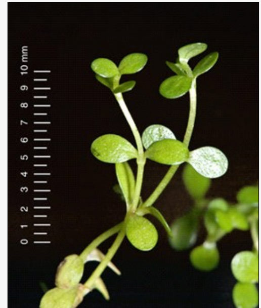
Caption: In cultivation. Mar 2007.

Photographer: Illustration: Catherine Beard