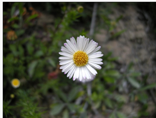
Caption: Eastbourne Hills

http://nzpcn.org.nz/flora_details.asp?ID=3912