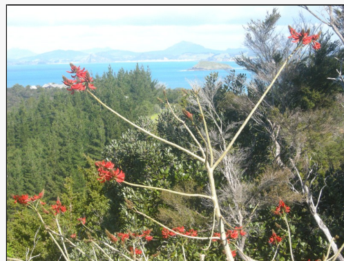
Caption: Matapouri Bay, Northland