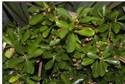
Caption: Kuaotunu West. Aug.