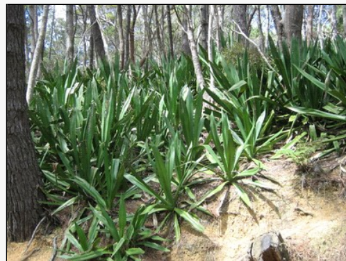
Caption: Furcraea foetida