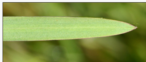
Caption: Leaf of Glyceria declinata