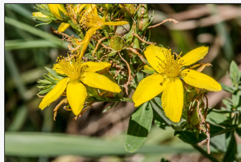
Caption: Lower Hutt. Feb 2013.

http://nzpcn.org.nz/flora_details.asp?ID=4094