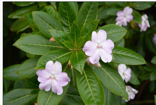
Caption: Algies Bay, north of Auckland

http://nzpcn.org.nz/flora_details.asp?ID=4103