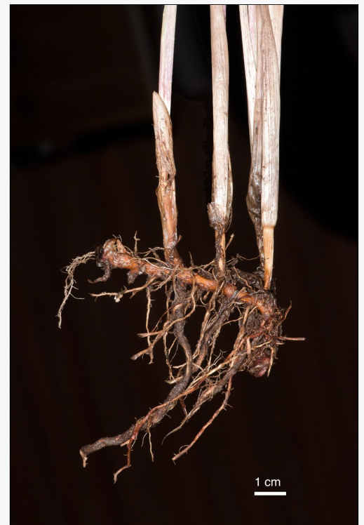
Caption: Creeping rhizome. Fensham Reserve, Wairarapa, Feb 2011.