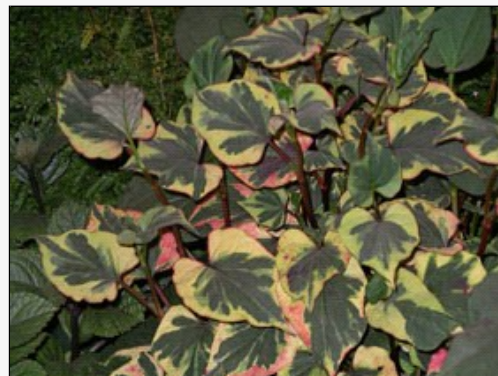
Caption: Houttuynia cordata

http://nzpcn.org.nz/flora_details.asp?ID=4113