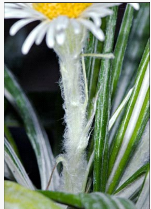
Caption: In cultivation ex Tainui Taipos, Wairarapa. Mar 2007.